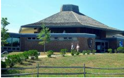
Salt Pond Visitor Center at Cape Cod National Seashore.