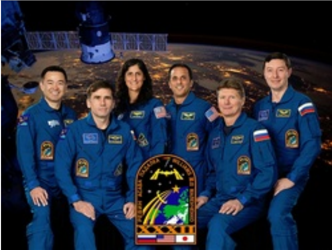
The Expedition 32 crew: (from left to right): Japan Aerospace Exploration Agency astronaut Akihiko Hoshide, KE5DNI; Russian cosmonaut Yuri Malenchenko, RK3DUP; NASA Flight Engineer Sunita Williams, KD5PLB; NASA Flight Engineer Joe Acaba, KE5DAR; Expedition 32 Commander Gennady Padalka, RN3DT, and Flight Engineer Sergei Revin, RN3BS.

NASA will televise the launch and docking of the next mission to the International Space Station (ISS), scheduled for 8:40 PM (CDT) Saturday, July 14 (0140 UTC Sunday, July 15). NASA Flight Engineer Sunita Williams, KD5PLB, along with Russian cosmonaut Yuri Malenchenko, RK3DUP, and Japan Aerospace Exploration Agency astronaut Akihiko Hoshide, KE5DNI, are completing preparations as they undergo their final Soyuz spacecraft fit. Live NASA TV coverage of the Soyuz TMA-05M spacecraft launch from the